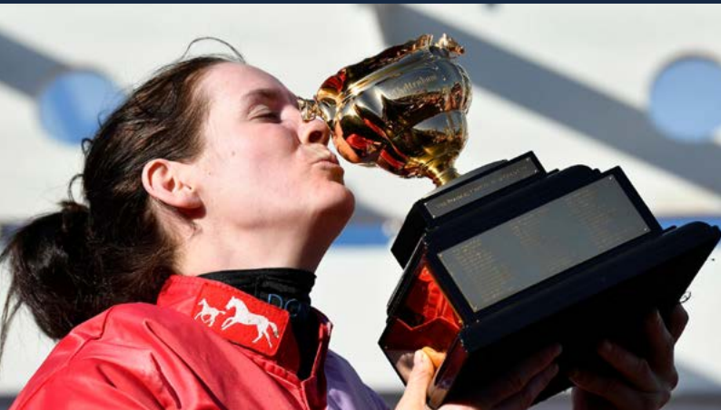
RACHAEL BLACKMORE KISSES THE GOLD CUP TROPHY AFTER A PLUS TARD'S WIN IN 2022