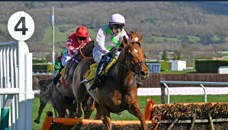
VAUBAN WAS AN IMPRESSIVE WINNER OF THE TRIUMPH HURDLE IN 2022