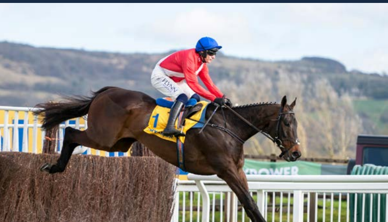
ALLAHO WON LAST YEAR'S RENEWAL FOR THE SECOND CONSECUTIVE TIME